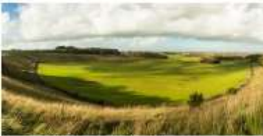
Landscape at Cheesefoot Head, a beauty spot and natural amphitheater in the South Downs National Park