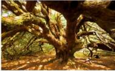
The ancient oaks of Kingsley Vale are some of the oldest trees in Britain

From Neolithic peoples, through to Roman occupation and beyond, it is a landscape steeped in the history of peoples who have called Britain their home.