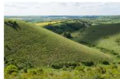
Bilsen Hill, one of the best examples of chalk downland in the National Park

an amazing image showcasing one of the National Park's many towns, villages and hamlets, such as images of high streets, village squares, public parks, churches, historic buildings or community event such as summer fetes.