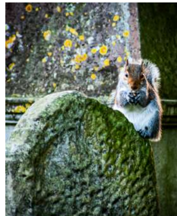
Grey Squirrel Kieran, Waterloooville