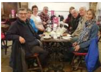
At the Buttery