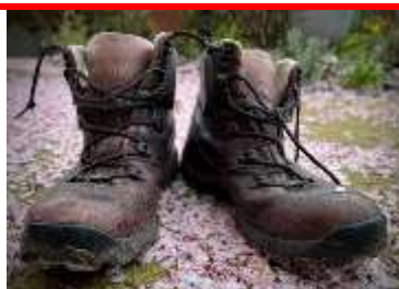
Worn but not worn out! Alan, Leigh-on-Sea