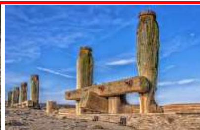
Beach groynes at Hornsey Alex, Pocklington & District

The April theme is " Impact " – submit your photograph(s) before the deadline of Thursday 25 th April 12.00 noon to https://u3auk.wufoo.com/forms/qzos7n202bqgm7/